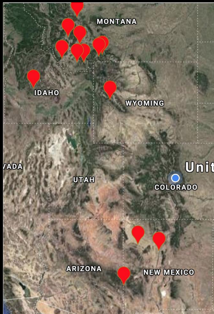
Figure 1: Map of study area. Red points show the location of where interviews were conducted.

My name is Angie Casini-Ropa, and with my mentor Matthew Collins, I have been researching about the ongoing human-carnivore conflict in the American West, studying the public perception on the effectiveness of preventative strategies to mitigate this conflict. For this research project I have been conducted thematic content analyses on interviews collected by my mentor (Figure 1). These interviews were transcribed and coded looking for patterns.