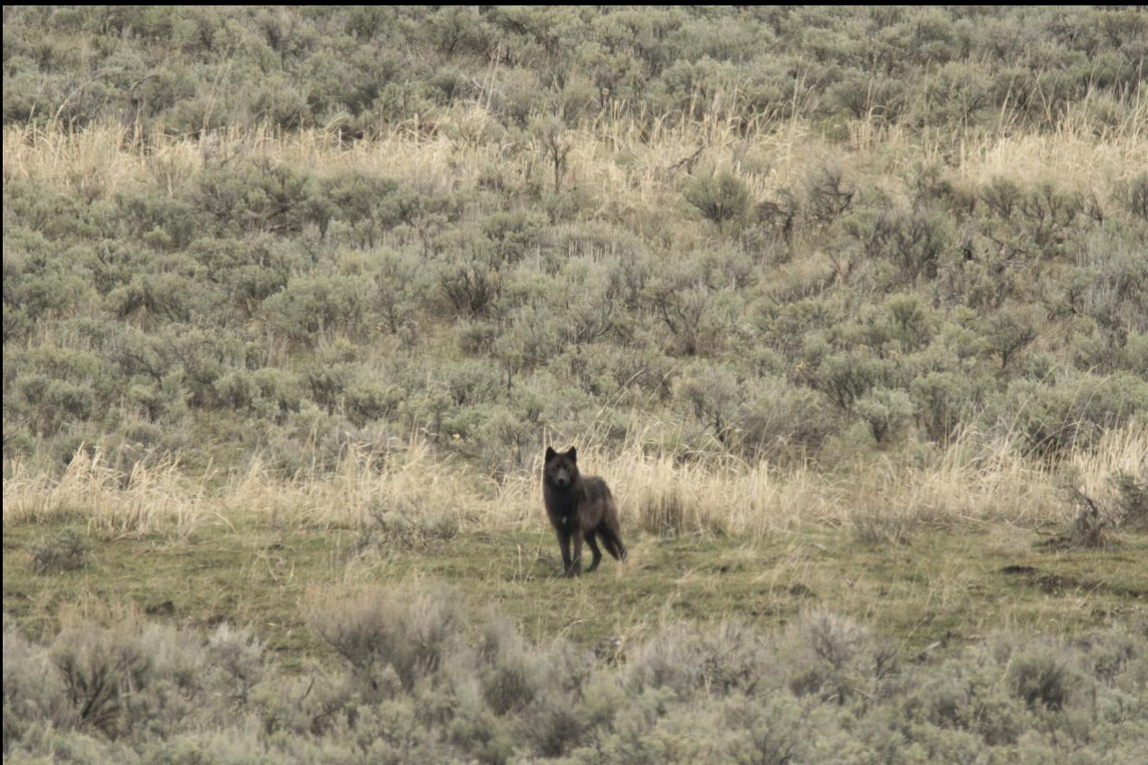
Figure 3: The protagonist of the poetry could be any wolf, like the one in this picture, a wolf in Yellowstone Park.

Working together and heeding advice Would make collaboration very nice With a bit of effort, experience, and time Preventative strategies will be sublime