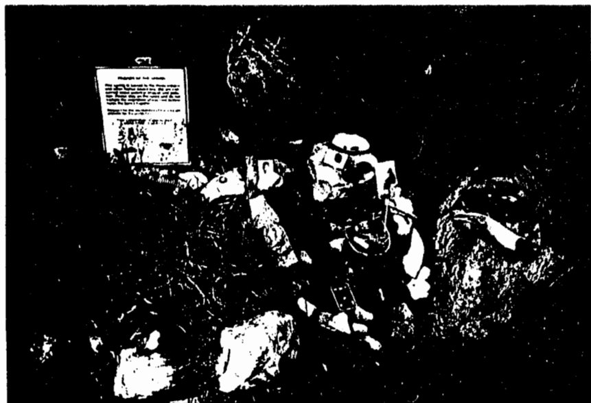
FIG. 4—An altar built near Panther Springs, on the slopes of Mount Shasta, surrounded by photographs, tarot cards, crystals, and other objects. A sign explains that the spring is important to Native Americans and should not be disturbed. Note that soil in front of the altar is bare. (Photograph by Paul F. Starrs, 1992)

n = 37 ) 1 and for others of 25 ( SD = 8.4 , n = 67 ). The possible range was from 0 to 40, so in both cases the mean was at the midpoint. These views of meadow conditions were about the same as those of scientists on a restoration project in the meadows at the time (Allen-Diaz, Phillips, and Fernández-Giménez 1992).